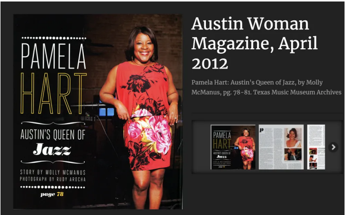
Austin Woman Magazine Feature